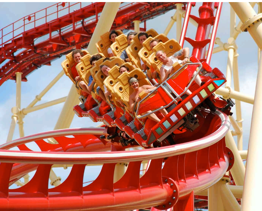
Below: X-Car Music "Hollywood Rip Ride Rockit", Universal Orlando Resort, USA

In addition to the space and purchase price, running expenses are another aspect of profitability – especially including maintenance and electrical power input. To make sure that the launch technology is attractive and economically realizable for all users, Maurer Rides uses modern LSM (linear synchronous motors) for the X-Car. Series-produced, well-engineered energy storage systems are now available that make it possible to continually recharge the energy needed for the launch, even for linear motor drives, thus keeping the power input low. The X-Car's LSM works with a connected load normal for