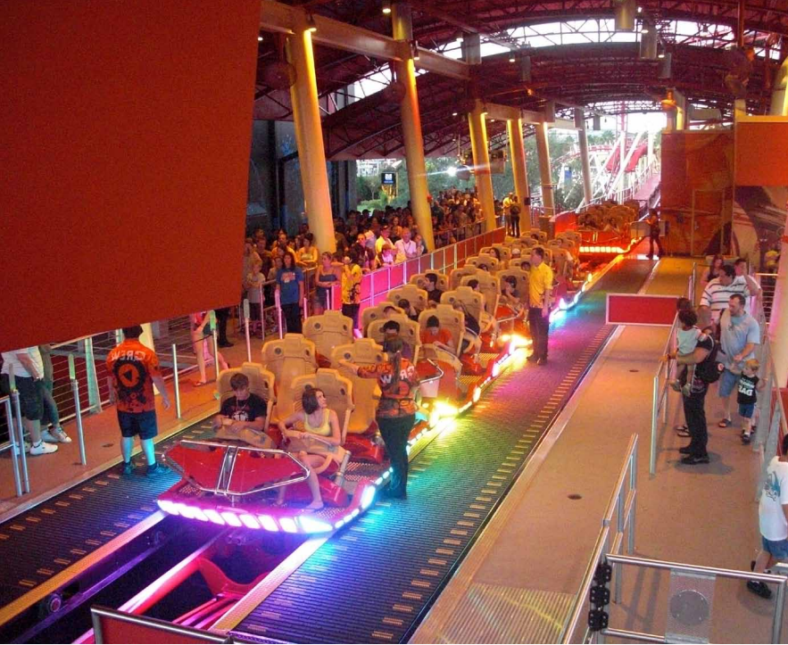
Above and above right: X-Car Music with Non-Inverted Loop: "Hollywood Rip Ride Rockit", Universal Orlando Resort, USA

concepts – they have to make economic sense, too. One aspect has already been mentioned: numerous attractive features packed into minimal space. Especially for smaller parks, there is a lot to be said for being able to position themselves with one particular highlight.