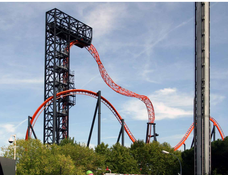
Below: SkyLoop XT450 "Abismo", Parque de Atracciones, Madrid, Spain

The X-Car is the embodiment of this new freedom. The term "revolution" is not so far-fetched, either, since it is far more than just a technical development. The X-Car offers passengers an entirely new kind of ride experience. Where shoulder bars used to offer constricting safety when it came to inversions or negative g forces, the X-Car – allowing for an unrestricted torso – now offers an entirely new kind of coaster experience on several well-known track designs.